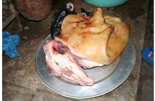
Wild pig offered at a forest specialty restaurant in Dong Hoi town of Quang Binh province

Hanoi: Ngoc Hoi District FPD seized 38 kg of wild pigs and brush-tailed porcupines from a car heading for Quang Ninh province from Hanoi. The wildlife was