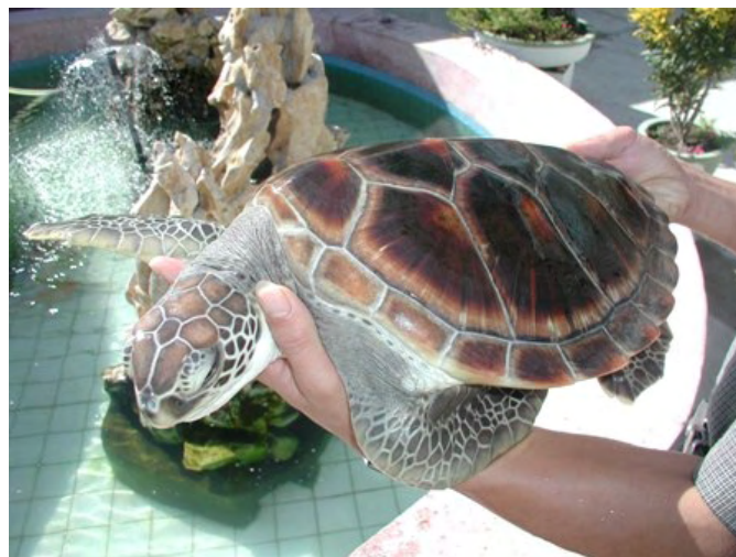
A marine turtle in Ha Tinh Province that was being kept in a fountain pool in front of a beach-front hotel.

Ho Chi Minh: The executive of a company in Cu Chi District voluntarily turned in a Malayan Sun bear cub to FPD that was being kept at a resort. The executive said that he became aware that possession of the cub was illegal and wanted to comply with the law and turn the animal in. The bear cub was not registered. (WCU Ref. Case 571)