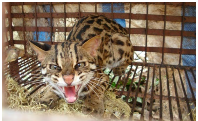
A leopard cat at a restaurant in Ha Tay province. Shortly after this photo was taken, the new National Mobile Forest Crime Unit raided the restaurant with district rangers and confiscated the cat

Ha Tay: The Mobile Force of the National FPD and district rangers raided a restaurant on Lang-Hoa Lac Highway and confiscated a leopard cat ( Prionailurus bengalensis ). The seizure followed the completion of a survey of restaurants and hotels along Lang-Hoa Lac Highway by the ENV Wildlife Crimes Monitoring Unit. (WCU Case Ref. 460).