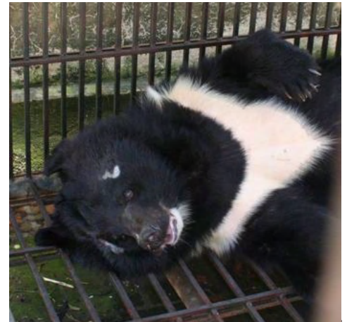
One of two bears being kept at a beach-front hotel in Nghe An Province. Although the bears are registered, according to hotel staff, the owners continue to sell bear bile extracted from the bears in violation of the law

With each inspection and response, the number of violators will be reduced as owners begin to realize that