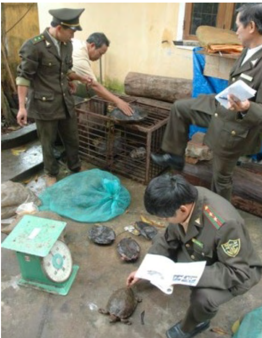
Quang Tri rangers inspect a shipment of turtles confiscated from a trader in April.

Quang Tri: The mobile ranger team discovered and confiscated nine turtles, one pangolin and 41 kg of monitor lizards and snakes on Highway 9 in Quang Tri province. The confiscated turtles and pangolins were placed in rescue centers at Cuc Phuong National Park, and the remainder of the wildlife was released. (WCU