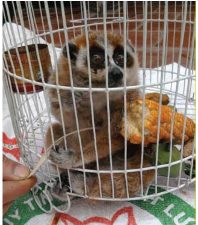
A loris recovered from the trade shortly before it was released into Ba Vi National Park

On March 10, local police confiscated a northern white-cheeked gibbon ( Hylobates concolor leucogennys ) from a local resident. The owner claimed he and his friends had just caught the gibbon nearby. The gibbon was transferred to the Cu Chi Rescue Center. (Case ref. 3270/ENV)