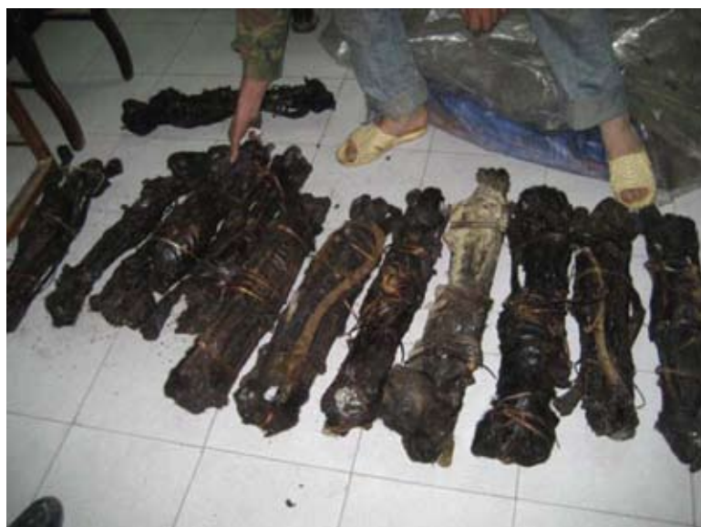
Hanoi Economic Police recently confiscated 12 dried douc langurs. The langurs were discovered in a private car that allegedly transported the animals from Dak Lak and was heading for the Chinese border.

A: By continuing to violate the law after receiving warnings and fines, the restaurant owner is sending a message to local authorities saying that he does not respect the authorities and the law. This is a perfect case to make a good example of. If repeated fines do not work, discuss revoking the owner's business license for engaging in repeated violations of the law. Increase the frequency of inspections and maximize fines that can be issued. It is critical to get these defiant violators to comply with the law as their lack of compliance also encourages others to engage in illegal activities.