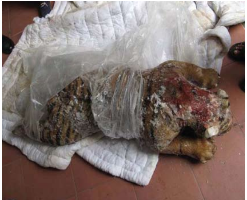
Tiger farms and private zoos are an ideal cover for illegal trade. Captive born animals and those that die in captivity can be sold on into the illegal trade

If the Ministry of Agriculture and Rural Development is truly concerned about the need to know tiger population numbers in preparation for the day that wild estimates reach zero, then this form of tiger breeding initiative MUST be carried out under the direct supervision of a government institution. This would ensure breeding management for conservation, the accountability of offspring with deaths and disposal properly documented.