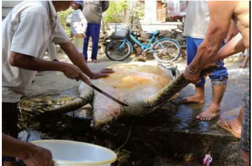
A marine turtle shortly before it was killed and decapitated by local residents of Nui Thanh district in Quang Nam Province.

On January 10, Thanh Hoa authorities arrested a man for