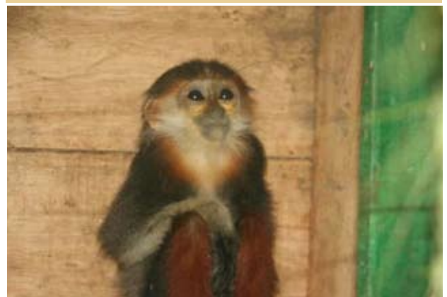
A local resident in Hue voluntarily turned over this redshanked douc langur to authorities. The animal was later transferred to Phong Nha Rescue Center.