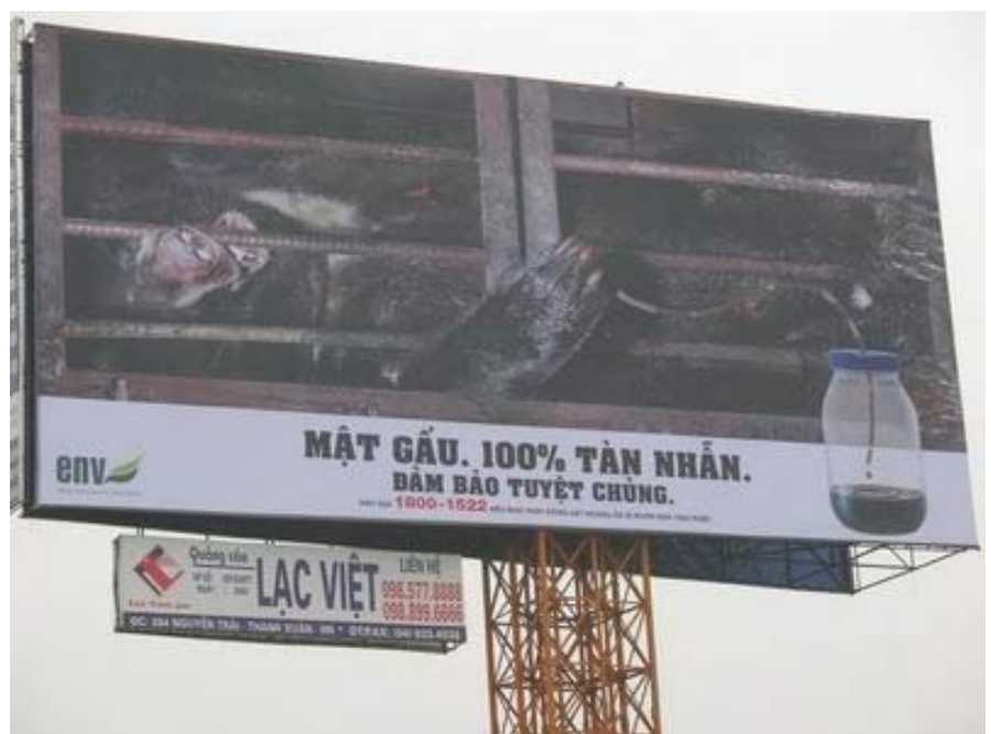
The billboard, located on Highway 1 just south of Hanoi is part of ENV's broader campaign to end bear farming in Vietnam and combat the illegal wildlife trade.

The new billboard and bus campaign messages were developed thanks to the generous time and support from the staff of Ogilvy, an internationally recognized advertising firm with offices in Ho Chi Minh city.