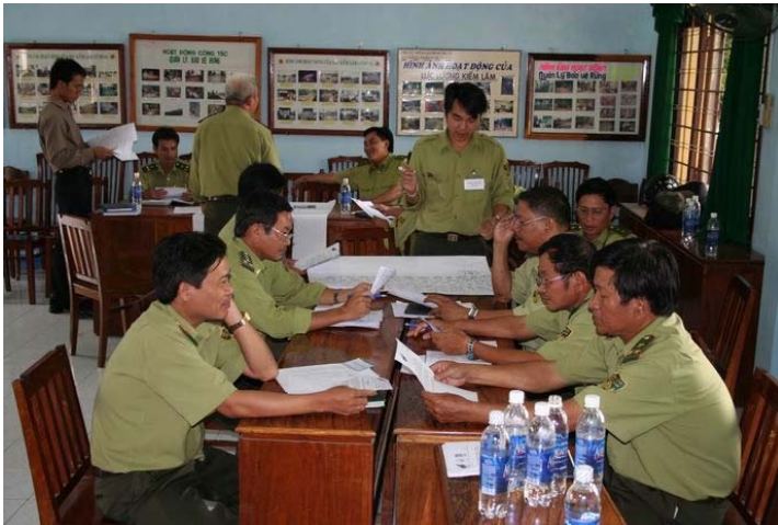
Forest rangers in Binh Thuan province prepare to debate the issue of how to deal with confiscated wildlife.

Can you name all 25 native tortoise and freshwater turtle species that are native to Vietnam? Neither can most frontline rangers tasked with wildlife protection in Vietnam. Tortoises and freshwater turtles comprise a major part of the illegal international trade of wildlife and each year, authorities intercept thousands of turtles in shipments destined for China. However, frontline authorities rarely can distinguish between species that they have seized resulting in decisions that do not take into consideration the importance of individual species (e.g. critically endangered conservation status).