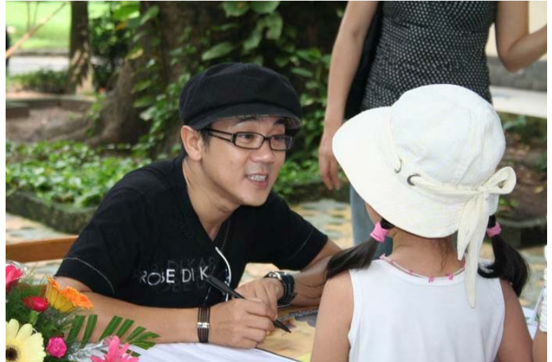
Actor Thanh Loc signs a "Bear Protection" poster for a fan on the opening day of the festival.

Some of the main attractions at the festival included an all-star cast of national celebrities who showed up to lend their support in efforts to protect Vietnam's bears. The celebrity line up included actor Quyen Linh, comedian Thanh Loc, actress and model Thanh Mai, and singer Nam Khanh and his band, as well as rock and roll star Anh Khoa, singer Mai Khoi, and actress Thuy Nga.