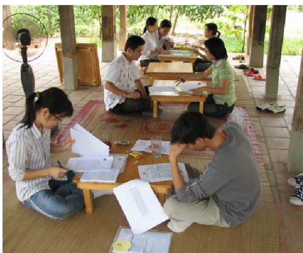
University students prepare and practice an EE communications activity in the shade beneath the pillar house classroom at ENV's National Training Center at Tam Dao.