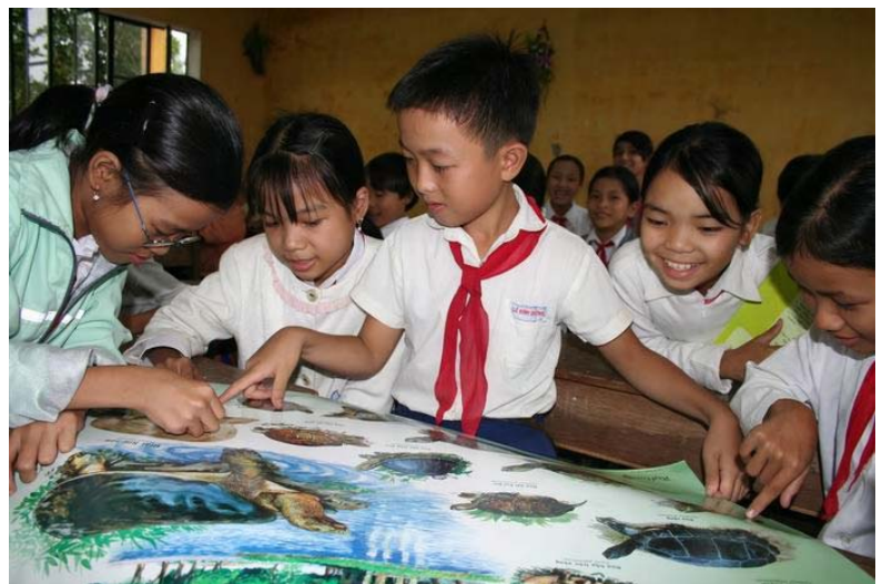
Sixth grade students from the Dien Trung commune school look over a poster of Vietnam's turtles during a special lesson plan on turtles.

Both the Rafetus and Mauremys awareness programs are part of an ongoing effort by ENV to raise awareness in communities bordering project sites where conservation activities are underway, in order to protect these critically endangered species within their habitat.