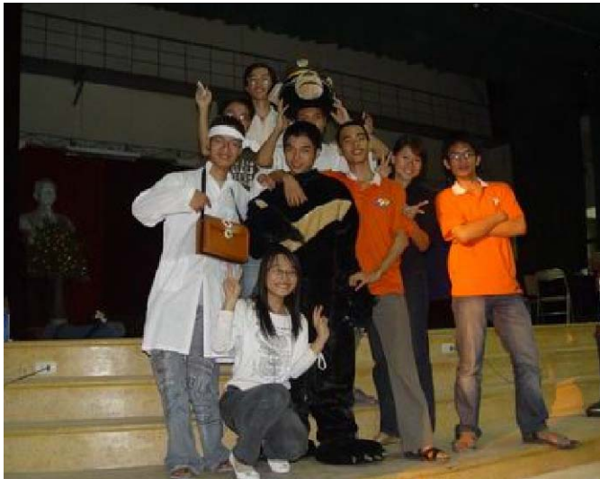
Student performers pose following a performance of "Especially for Bears" for fellow students at their university.

In addition to spending a week supporting the bear festival at Saigon Zoo, the trip south was the longest single ENV mobile mission for the year, lasting a total of 30 days of near continuous programs and activities in the field.