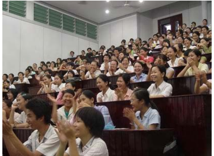
University students are always easy to work with, and are eager to participate in learning.