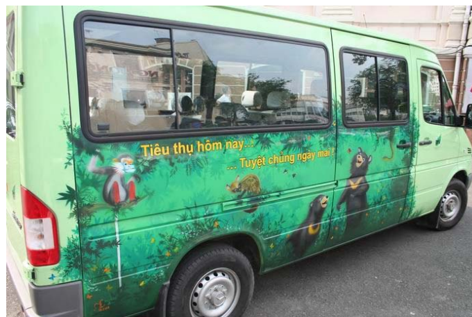
The ENV Mobile Wildlife Awareness van features endangered species illustrated along the side of the van, and a message, “Consumption today will lead to extinction tomorrow”.

Ha notes with some humor that efforts to carry out monitoring of restaurants and known trade establishments in Dong Nai last month were problematic. “On a few occasions, we just rolled right in before realizing that our cover was blown,” says Ha. “We later perfected a strategy of parking up the road and walking in.”