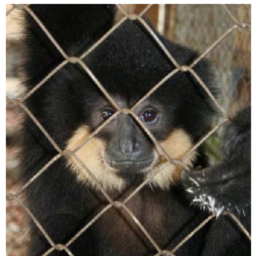
A yellow-cheeked gibbon at a restaurant in Dong Nai province. The Wildlife Crime Unit is working with local authorities to have the gibbon transferred to a rescue center.