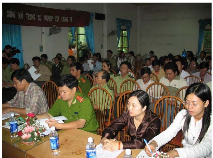
Restaurant owners, police, local community leaders, and Forest Rangers gather for a meeting in Ha Tay to encourage local businesses to comply with wildlife protection laws.

However, unlike other efforts carried out by ENV focused on gaining owner compliance with the law through a combination of awareness, commitments, monitoring, and strict enforcement, the Ha Tay campaign has initially faltered with monitoring surveys showing that only five of 27 restaurants were in compliance with the law, and many of the other 22