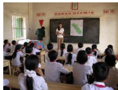
Figure 1. Australian Foundation for the Peoples of Asia and the Pacific (AFAP) training in Tam Dao National Park

In addition to receiving basic introduction to the theoretical aspects of environmental education, the trainees were exposed to participatory teaching methods, and gained practical knowledge and experience in preparation for carrying out a program in Dai Tu District. During the course of the training, a six-lesson draft program was designed for students from grade 6 and field tested in schools in Khoi Ky commune. ENV plans to continue to work closely with the Dai Tu district project as the program develops during the coming months.