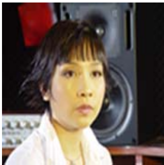
Figure 4. My Linh, pop singer, calls upon people to stop using bear bile.

In August, ENV produced a Public Service Announcement (PSA) for television illustrating the plight of Vietnam's bears, captured from the wild and maintained in captivity in order to exploit bile for the growing commercial bear bile trade. The PSA featured the well-known pop singer, My Linh, who urged the public not to use bear bile or products made from bears. In October, the PSA was distributed to 63 provincial television stations nation-wide. In November, a total of 40 provinces have begun to air the 30 second spot, including the major urban centers of Hanoi, Ho Chi Minh, Hai Phong, Da Nang, and Hue.