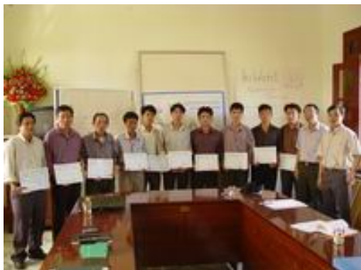
Figure 2. Van Long Nature Reserve staff receiving certificates for participating in the training course.

In November 2004, ENV carried its 20 th major training initiative aimed at helping Van Long Nature Reserve (Ninh Binh Province) develop and implement an awareness program focused on adult residents of local communities. Ten rangers and nature reserve staff participated in the ten-day intensive training course during which trainees worked with ENV counterparts to design and develop a community based conservation awareness program which was then field tested in two villages bordering the reserve. Van Long Nature Reserve, which encompasses a large emergent wetland and exposed limestone hills is particularly important for its resident populations of Delacour langurs ( Trachypithecus delacourii ), one of the world's most critically endangered primates. The training was carried out under agreement between ENV and Hoa Lu - Van Long Nature Reserve Management Board, with financial support provided by Capacity Building International (InWent) and facilitated by Fauna and Flora International's Pu Luong-Cuc Phuong Conservation Project.