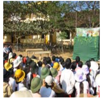
Figure 3. Puppet show in Cuc Phuong National Park.

In October, ENV concluded its training and certification phase, and transferred responsibilities for training over to the national park. ENV continues to provide technical inputs to the program, and remains responsible for evaluation and monitoring, and coordinating external training programs carried out at Cuc Phuong National Park.